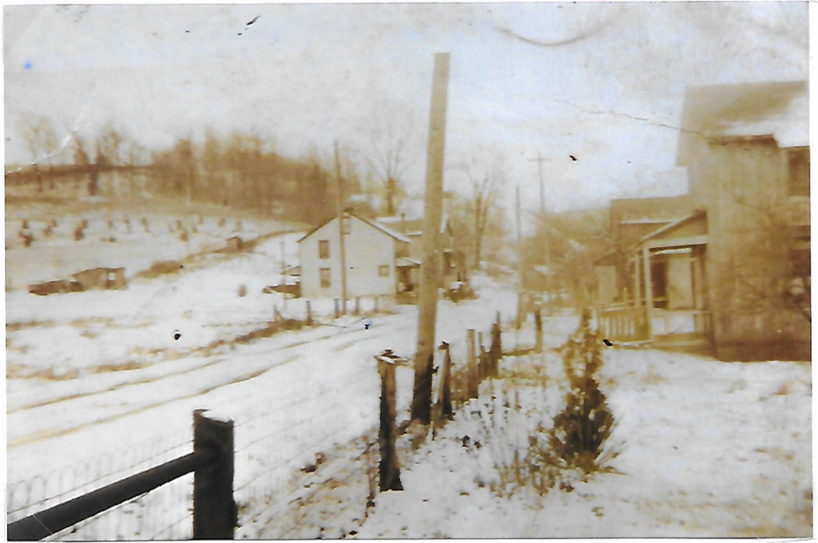
LOOKING SOUTH ON TIPPLE ROAD IN GOODTOWN