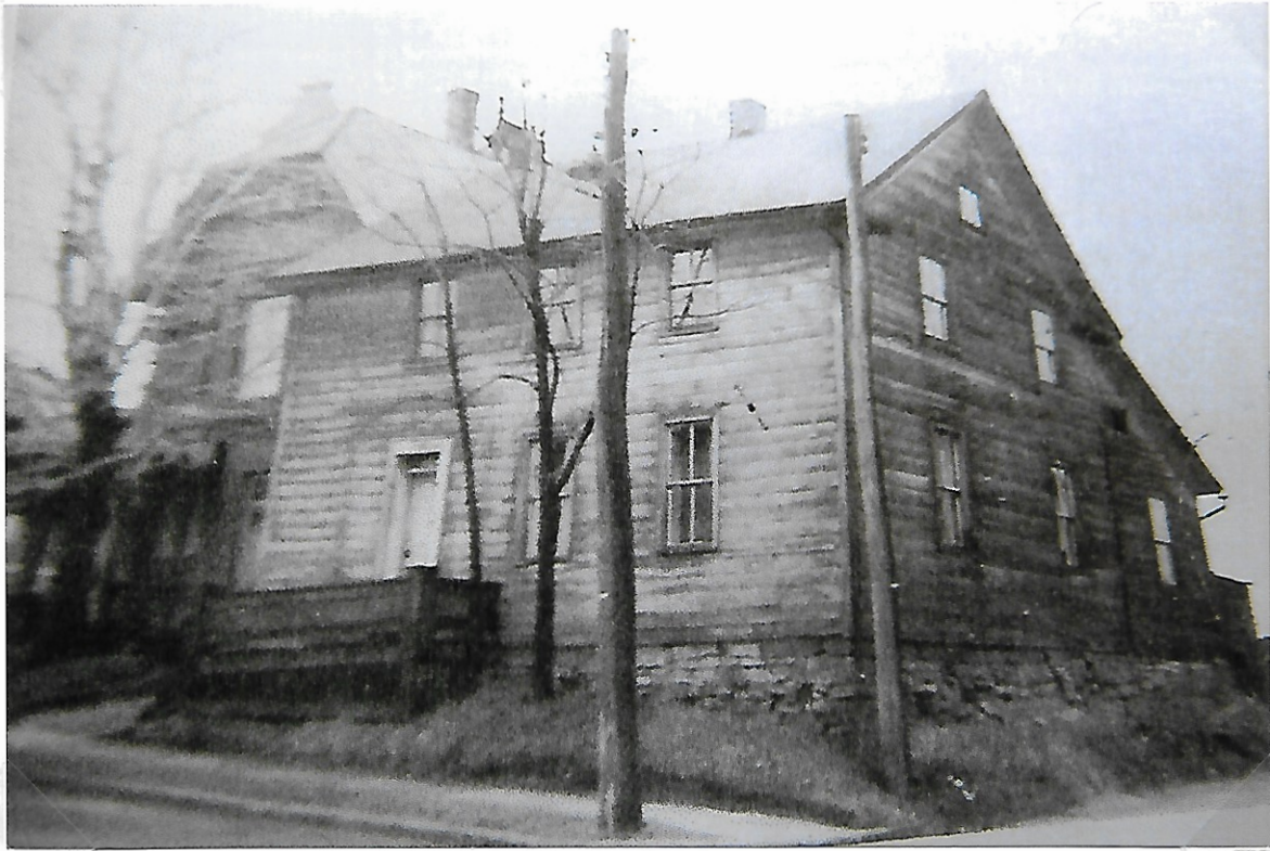
304 DIAMOND STREET – BERLIN