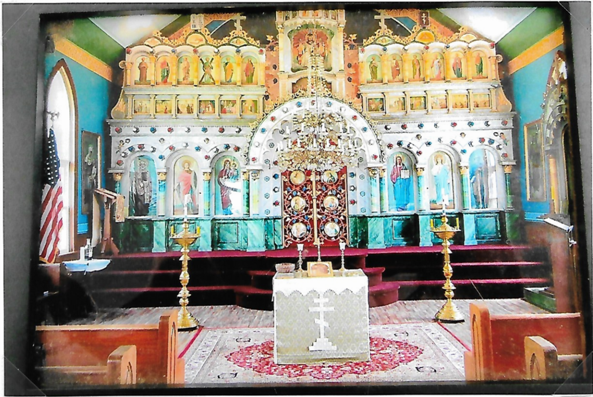
SS PETER AND PAUL'S ORTHODOX CHURCH IN GOODTOWN!