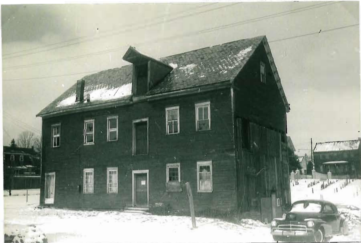
The flour mill ceased to operate in the early 1930s but the cider press operated until the late 1930s. Later the building served as the personal residence of Edward and Mary Buratty. The structure was dismantled around 1980. Roger and Angie Rubright reside in a mobile home on the same property.