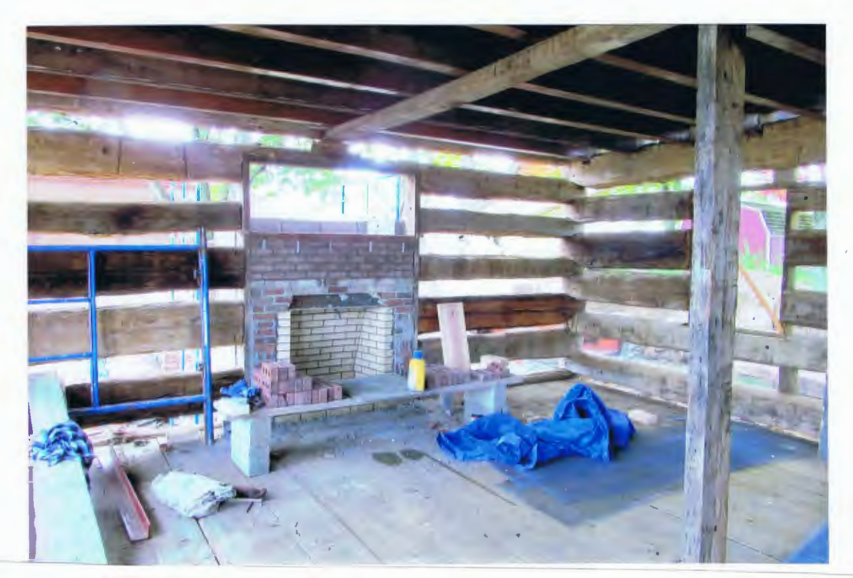
THE INTERIOR OF THE LOG HOUSE WITH ITS FIRE PLACE