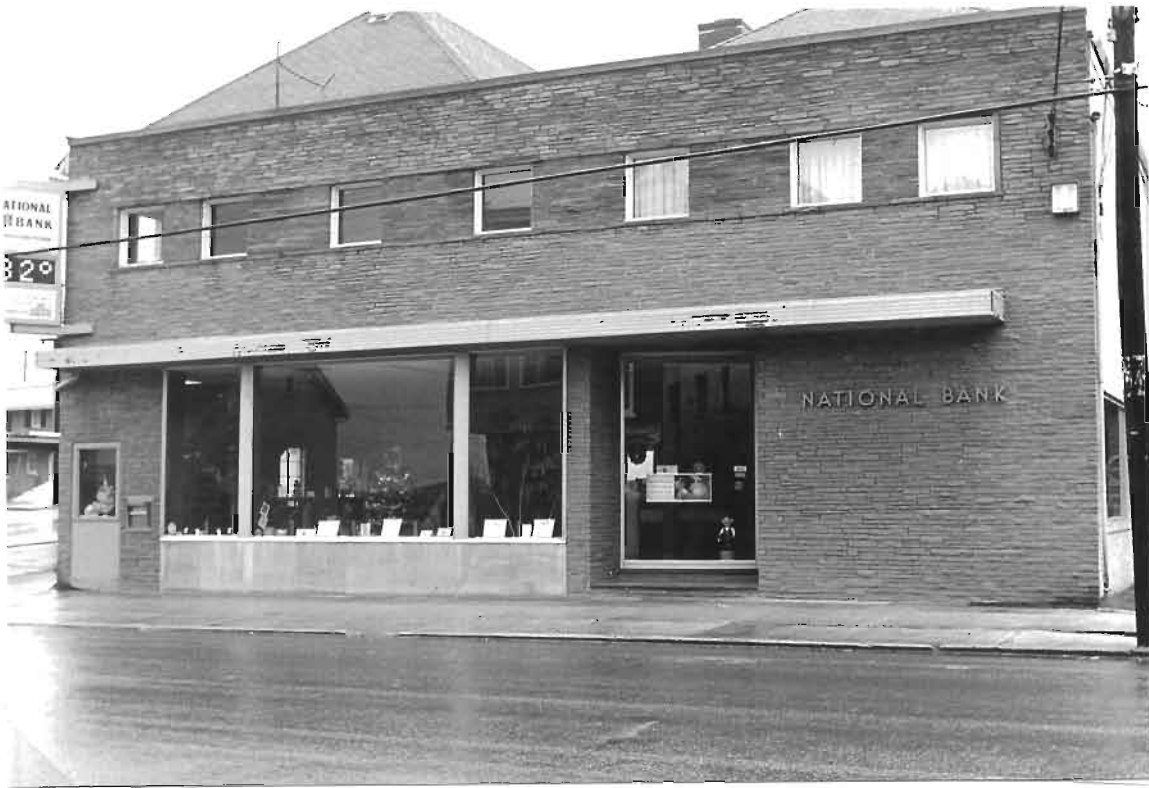
THE SHANKSVILLE BRANCH OF THE NATIONAL BANK OF WESTERN PENNSYLVANIA