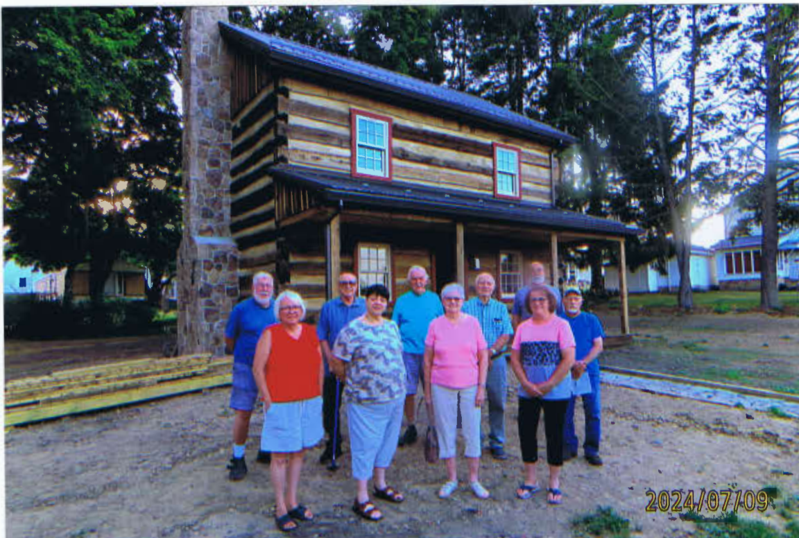
ANOTHER PICTURE FOLLOWING OUR JULY 9, 2024 BOARD MEETING. MAKING SOME DECISIONS