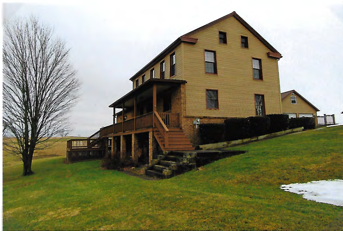
2019: JIM & JANE BLACK – BROTHERSVALLEY TOWNSHIP