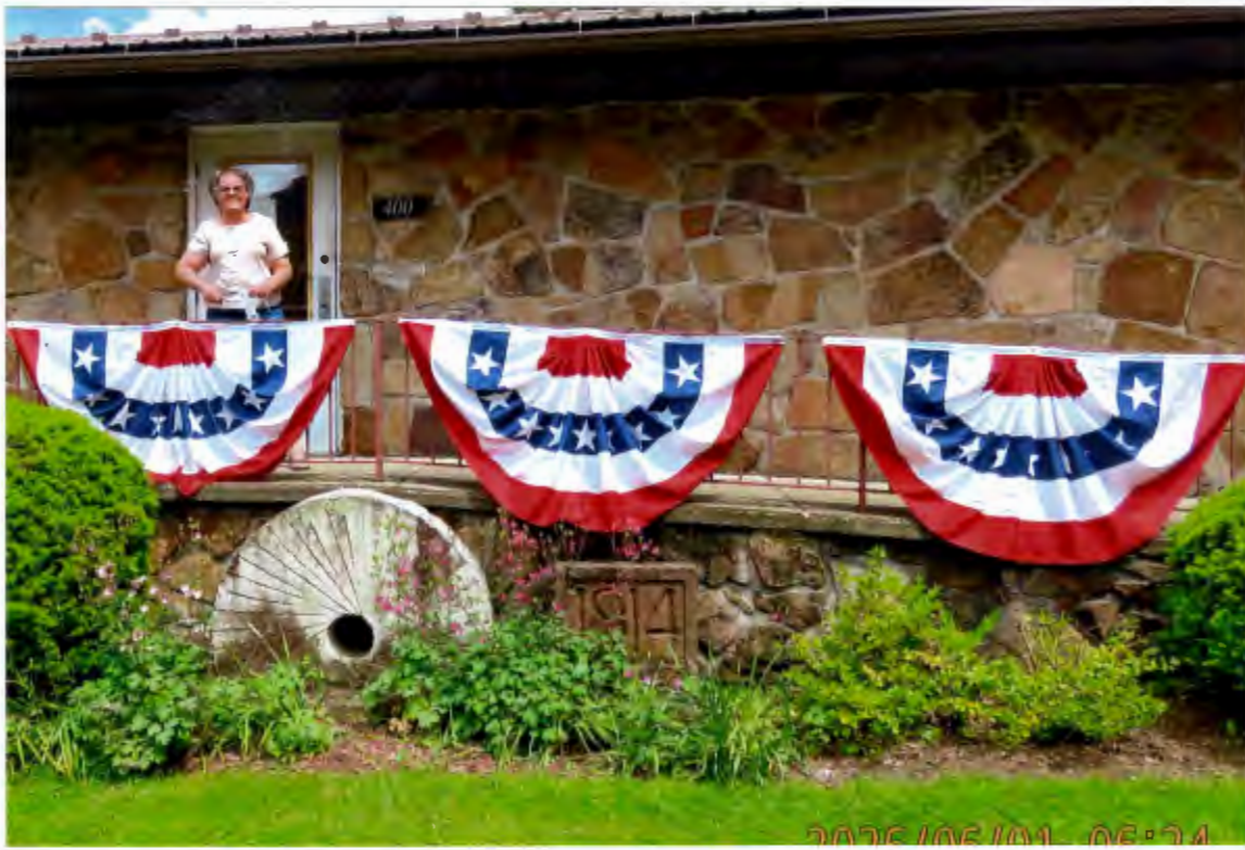
FRONT OF THE GENEALOGY-OFFICE BUILDING ALL DECKED OUT FOR THE CELEBRATION!