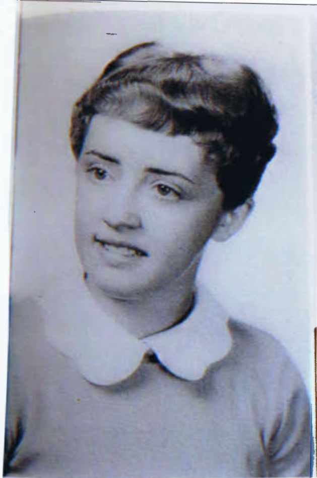
Joyce Ann Smith College Preparatory