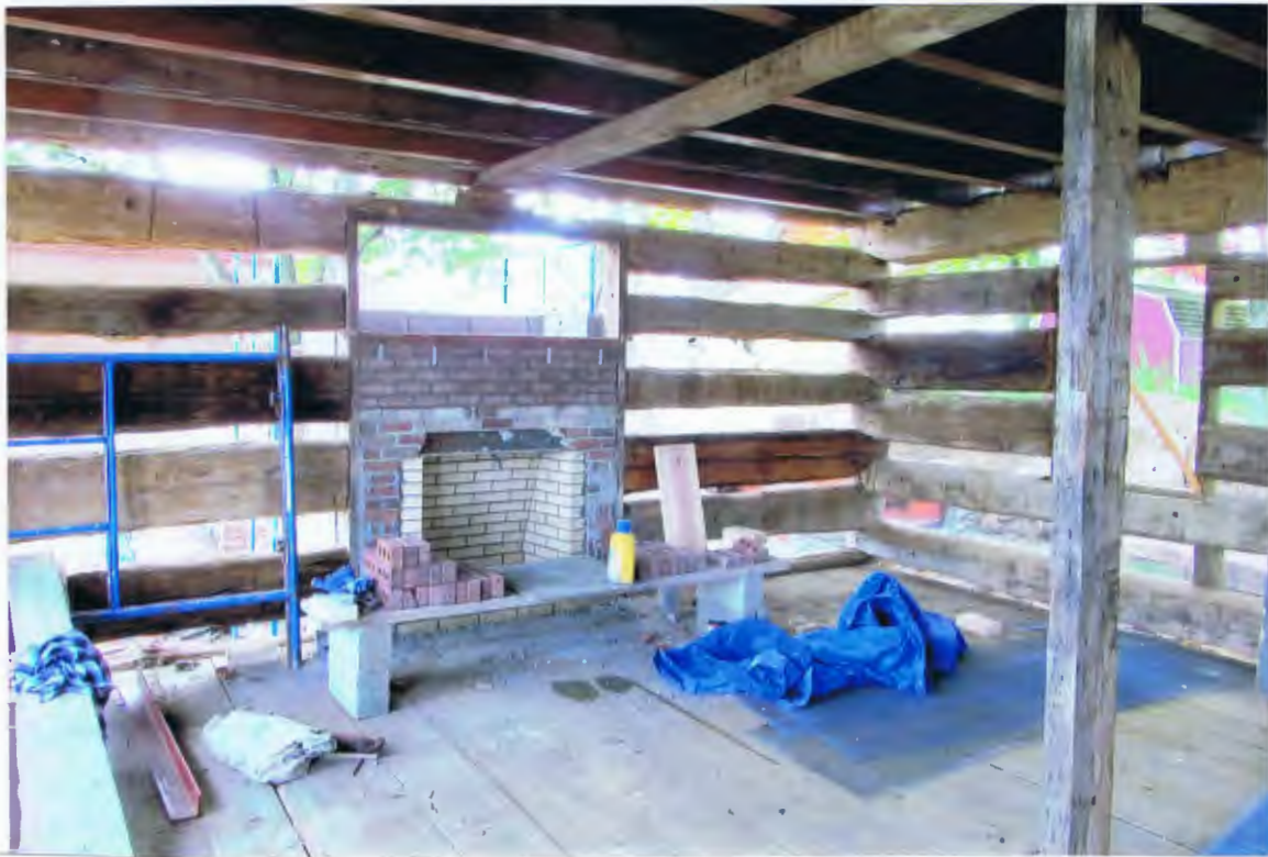
THE INTERIOR OF THE LOG HOUSE WITH ITS FIRE PLACE