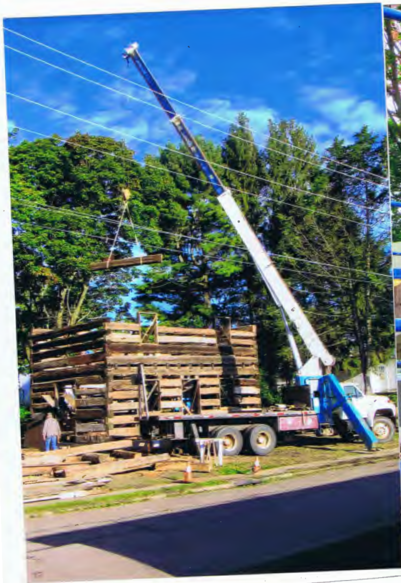
LIFTING A LOG TO THE SECOND FLOOR OF THE LOG CABIN ON SEPTEMBER 20, 2023